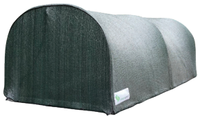
Extra Shade Cover

ALL STANDS RAISE VEGEPOD TO WAIST HEIGHT. MADE FROM GALVANISED POWDER COATED STEEL.